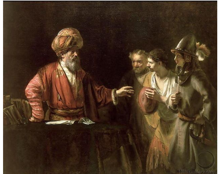
Parable of the Unforgiving Servant Willem Drost, 1655

Baptisms & Marriages: Please contact the Parish Priest