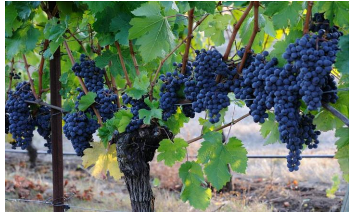
The Vineyard of the Lord is the House of Israel

Baptisms & Marriages: Please contact the Parish Priest