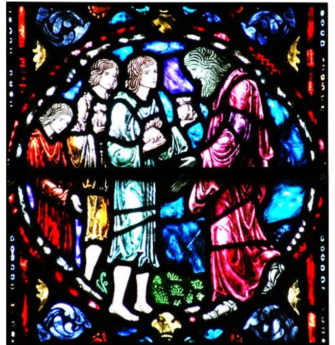
The Parable of the Talents

Baptisms & Marriages: Please contact the Parish Priest