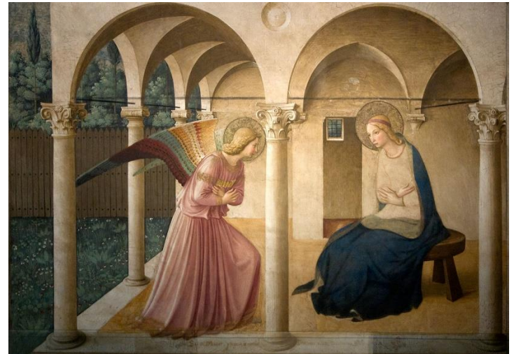
The Annunciation, Fra Angelico - 1438-1445