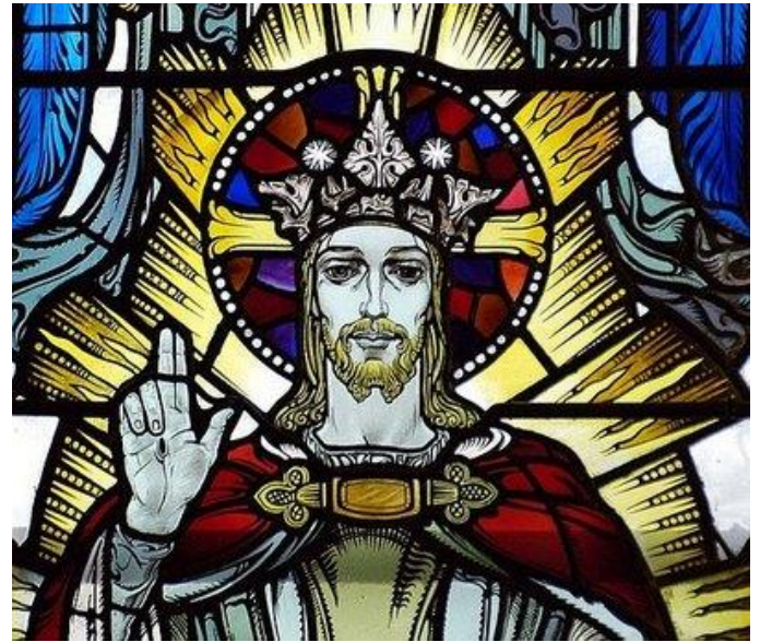
Our Lord Jesus Christ, King of the Universe

Baptisms & Marriages: Please contact the Parish Priest