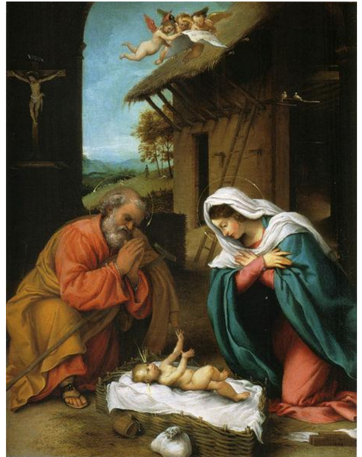
The Nativity, Lorenzo Lotto - 1523

Baptisms & Marriages: Please contact the Parish Priest