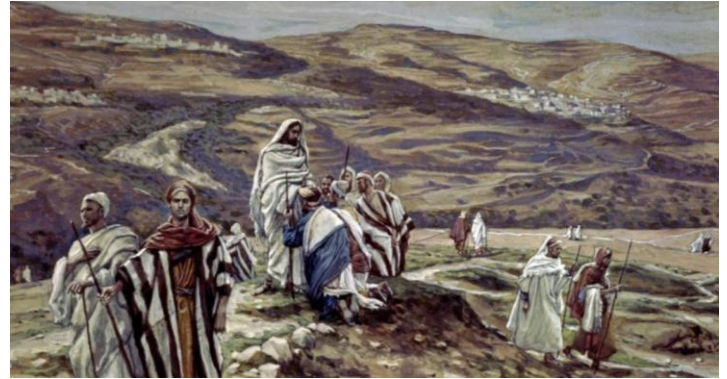
Jesus Sending out the Disciples, James Tissot 1886-1896