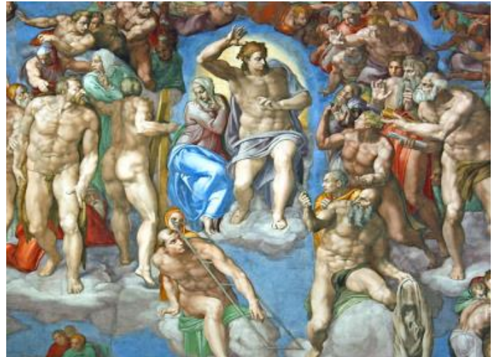
The Last Judgement, Michelangelo, Sistine Chapel 1535-1541

Baptisms & Marriages: Please contact the Parish Priest