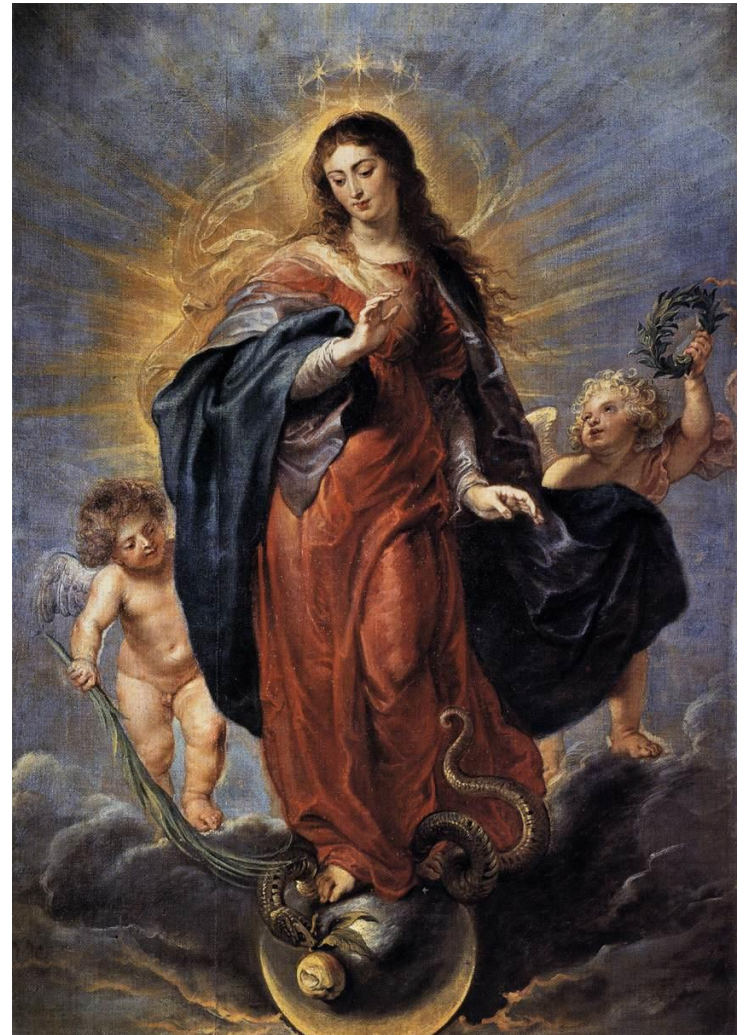
The Immaculate Conception, Rubens 1628

Baptisms & Marriages: Please contact the Parish Priest