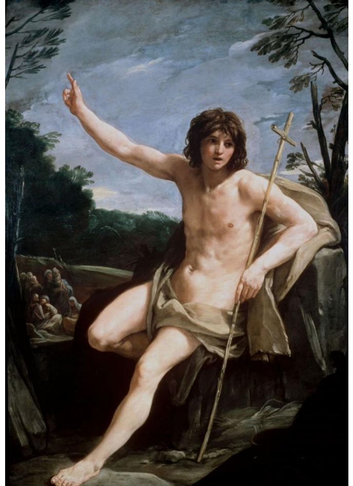
St John the Baptist in the Wilderness, Guido Reni 1636-7

Baptisms & Marriages: Please contact the Parish Priest