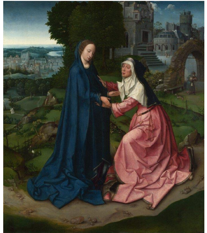
The Visitation, 1516, Goossen van der Weyden

Baptisms & Marriages: Please contact the Parish Priest