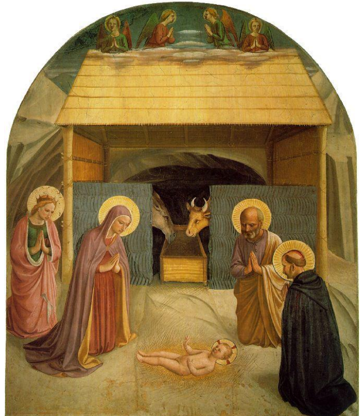
The Nativity, Fra Angelico 1439-43