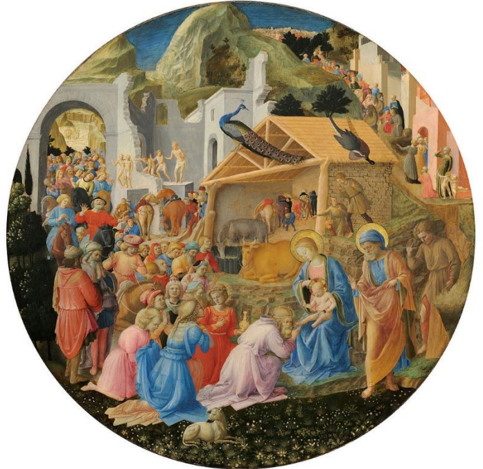
The Adoration of the Wise Men, Fra Angelico 1440

Baptisms & Marriages: Please contact the Parish Priest