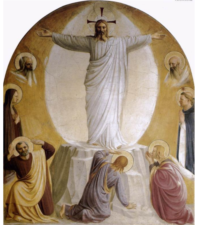
The Transfiguration, Fra Angelico 1440-42