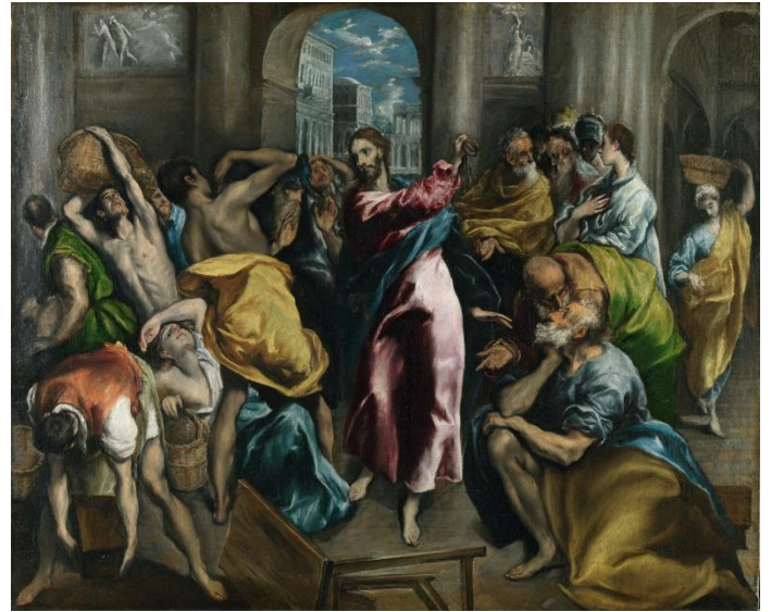
The Cleansing of the Temple, El Greco

Baptisms & Marriages: Please contact the Parish Priest