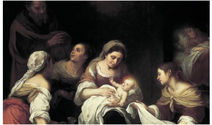
The Birth of St John the Baptist, Bartolomé Esteban Murillo, 1660

Seniors Club ..... 4th July Cake Sale..... 8th July Eucharistic Congress..... 7th-9th September