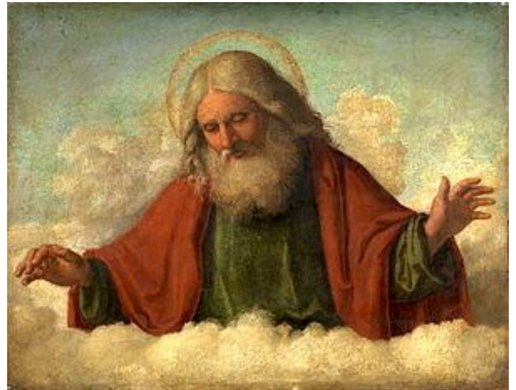
God the Father, Cima da Conegliano, c. 1515

Baptisms & Marriages: Please contact the Parish Priest