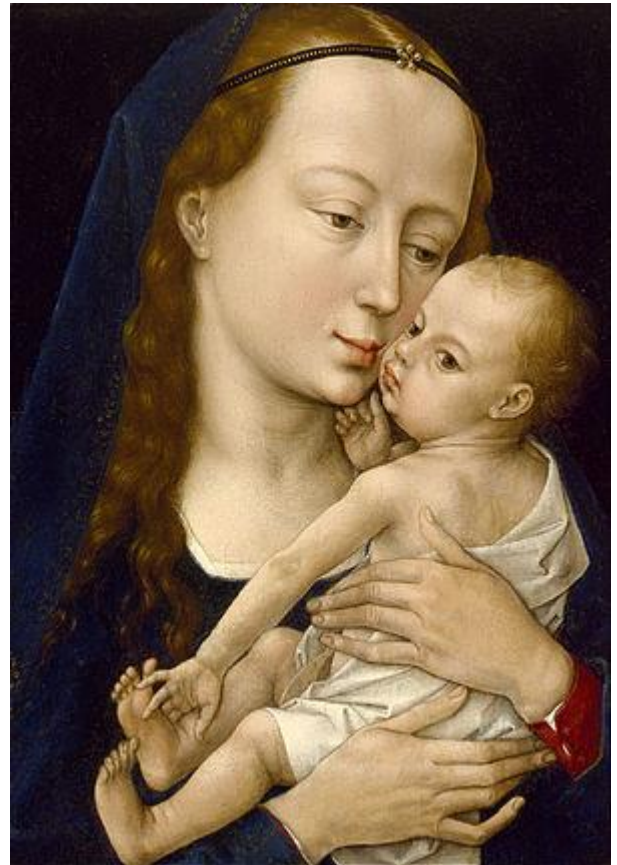
Virgin and Child, Rogier van der Weyden 1454

Baptisms & Marriages: Please contact the Parish Priest