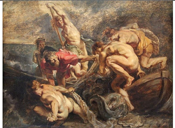
The Miraculous Draught of Fish, Peter Paul Rubens 1610

Baptisms & Marriages: Please contact the Parish Priest