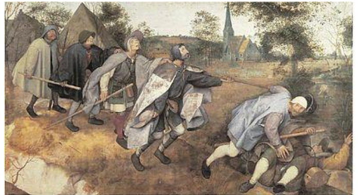
The Blind Leading the Blind, Pieter Bruegel the Elder 1568

Baptisms & Marriages: Please contact the Parish Priest