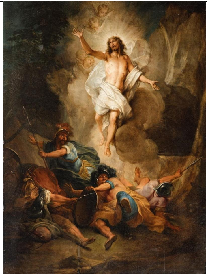
The Resurrection of Christ, Nicholas Bertin

Baptisms & Marriages: Please contact the Parish Priest