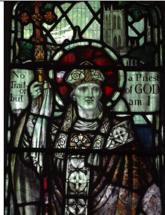
St Thomas à Becket