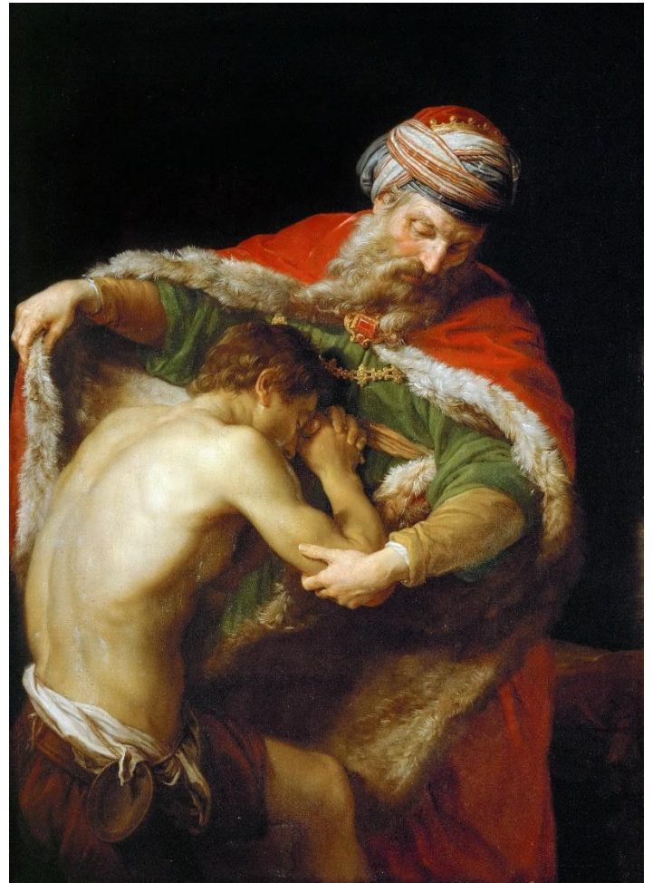
The Return of the Prodigal Son, Pompeo Batoni (1773)

Baptisms & Marriages: Please contact the Parish Priest