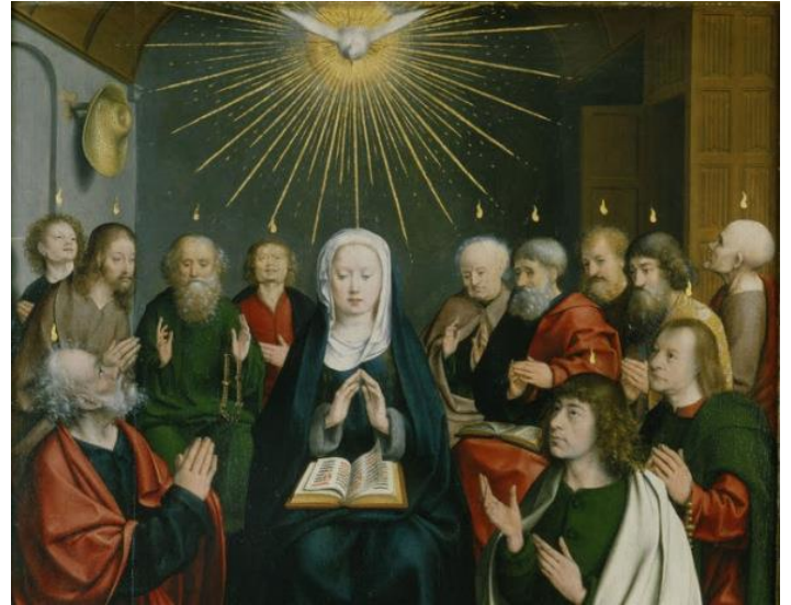
Pentecost, Jan Joest van Kalkar 1505-08