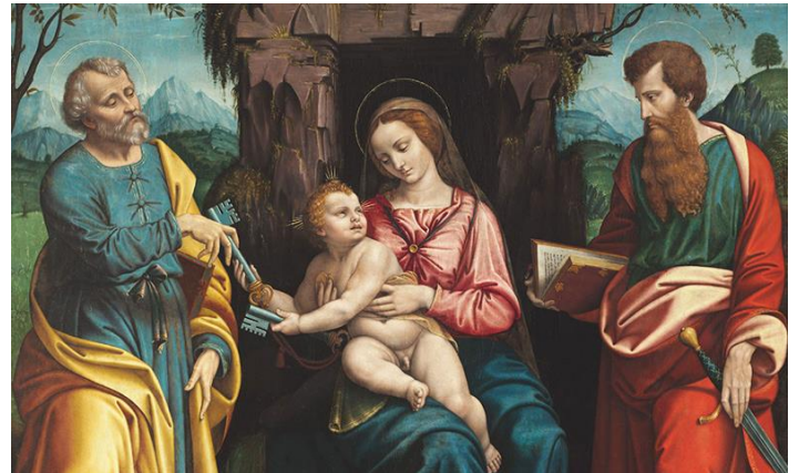
The Virgin and Child with SS Peter & Paul, Girolamo Figino

Baptisms & Marriages: Please contact the Parish Priest