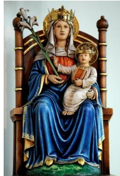
Our Lady of Walsingham

The appearance of Our Lady in Walsingham almost 1,000 years ago has ever since encouraged those who seek her in that place and across the land to experience the joy of the Incarnation, and to know that we can bring the Saviour to birth in our own lives. The witness of the Shrine in Walsingham over the centuries reminds us of the absolute necessity of intercession for those whom we care, those for whom we are bound to pray, and those for whom there is no-one else to pray. The recent history of Walsingham itself also speaks to us of the importance of prayer for Christian unity, as all kinds of Christians make pilgrimage to that place year after year.