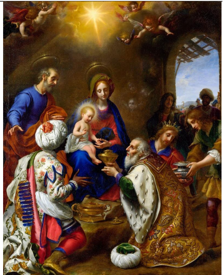
The Adoration of the Kings by Carlo Dolci 1649

Fairer than the sun at morning was the star that told his birth; to the lands their God announcing, hid beneath a form of earth. By its lambent beauty guided, see, the eastern kings appear; see them bend, their gifts to offer, gifts of incense, gold and myrrh. Solemn things of mystic meaning: incense doth the God disclose; gold a royal Child proclaimeth; myrrh a future tomb foreshows. Holy Jesu, in thy brightness to the Gentile world displayed, with the Father and the Spirit endless praise to thee be paid.